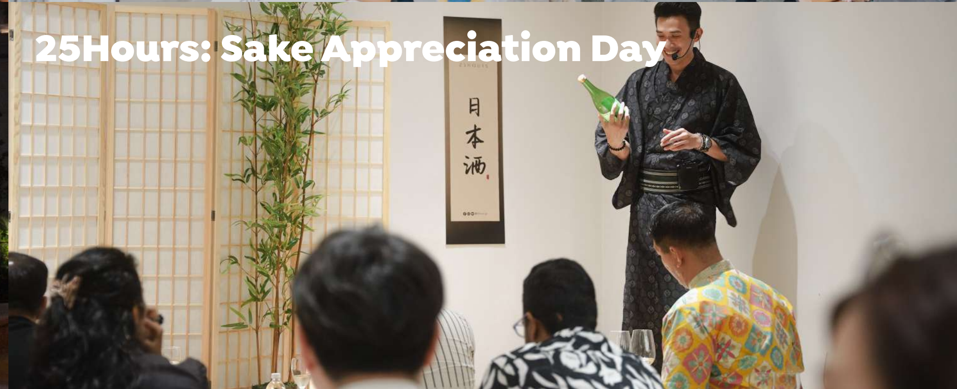
25Hours: Sake Appreciation Day