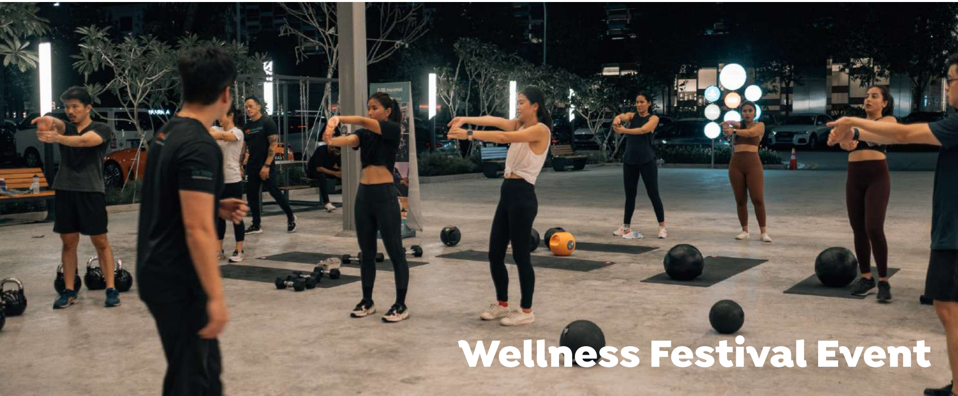
Wellness Festival Event