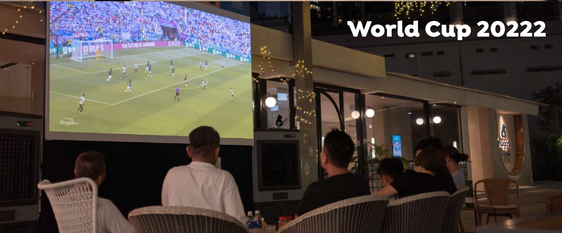
World Cup 2022